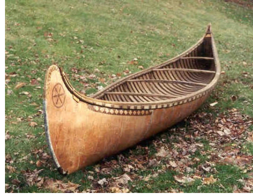
Traditional Birch Bark Canoe

and the wood for spools and bobbins (and everything else where this was the only tree!). Wine can be made from its sap, and green dye and ointment from the leaves. Birch leaf tea is said to be good for almost every complaint!