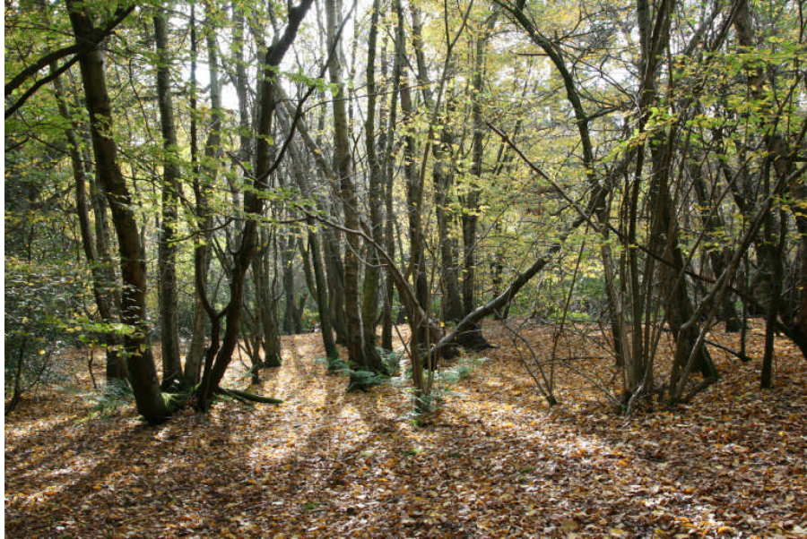
A carpet of Autumn leaves in the November sunshine

With winter upon us our woods enter another phase in their annual cycle. The ever changing woodland vistas are always a joy and the above photograph captures the last part of the Autumn phase before Winter sets in and the last of the dead leaves tumble onto the woodland floor. Whilst the colourful woodland flowers are a bonus during the spring and summer months, it is the trees that are at the heart of our nature reserve. On page 2, Gill waxes lyrical about our glorious silver birch trees and she also tells us about the Jungle Buffer that provides a mini jungle on our doorstep. Those of you who visit our woods on a regular basis will have seen that the Bridleway Upgrade is now happening. On the back page, Stuart explains the progress being made and the work still to be done. Find out about the Bridleway Gate and Archaeological Digs on page 3, plus an update on Phases 4 and 5 on page 2.