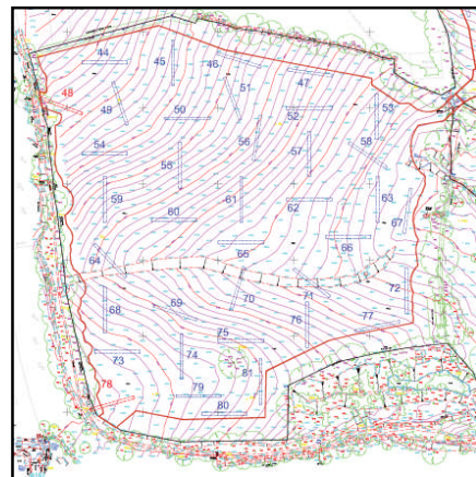
Map of numbered search trenches for archaeology investigation

Early indications are of very limited interest, with a single fragment of medieval pottery discovered in one trench. No Roman villas here it seems, despite the Roman Road being close by!